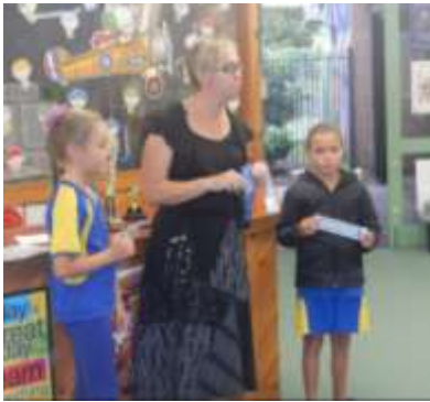
PRI DE ribbons