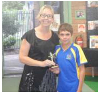
PRI DE Trophy