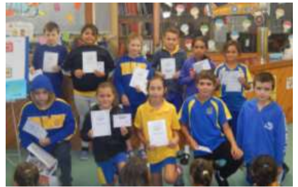
Birruwa Bronze & Silver awards