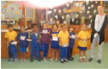
Gwiyaala Bronze awards