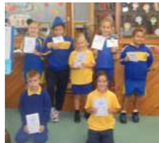
Walimbura Bronze & Silver awards